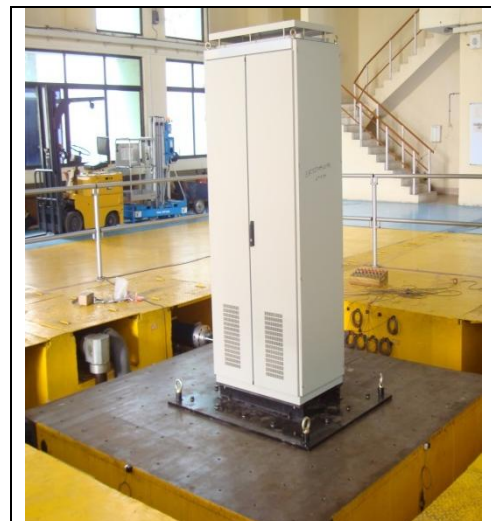
FIG.1 ELECTRICAL CABINET MOUNTED ON TRI-AXIAL SHAKE TABLE

At most care is taken to ensure that mounting .