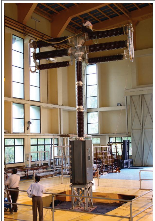
SHAKE TABLE TEST ON A CIRCUIT BREAKER

earthquake ground motions with high fidelity and little distortion. The seismic qualification tests on various electrical equipments are being conducted using the tri-axial earthquake simulation system, which features a 10-ton pay load capacity shake table of size 3 m × 3 m. An advanced control system allows the reproduction of earthquake ground motions with high fidelity.