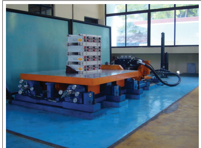
SERVO-HYDRAULIC TEST SYSTEM

low frequency endurance and seismic tests on products and equipment in one axis at a time. This facility is extensively used to qualify equipment for Railways, Automobile and Electronic Industries.