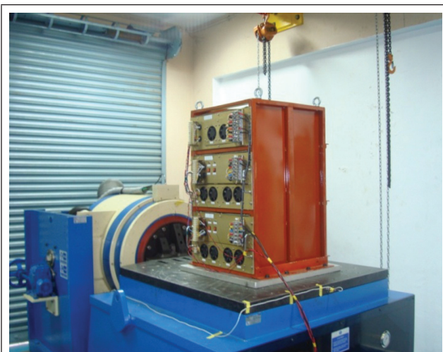
VIBRATION TEST USING ELECTRO DYNAMIC SHAKER

In addition a servo-hydraulic vibration test system is installed in this centre to carry out low frequency endurance and seismic tests on products and equipment in one axis at a time. This facility is extensively used to qualify equipment for Railways, Automobile and Electronic Industries.