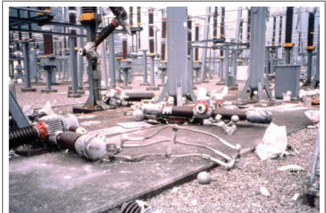
Damage like this has been observed from ground motions less than 0.1 g.

The IEEE Standard 693, “recommended Practice for Seismic Design of Substations” clearly defines seismic qualification levels, qualification procedures, and acceptance criteria. Earthquakes with zero period acceleration of 0.1 g can cause severe damage to the substation equipments. The IEEE Standard 693 recommends that sites with projected ground motions above 0.1 g should have their equipment seismically qualified. Thus power utilities with service areas in seismic Zone-III, IV and V (according to the IS 1893:2000) should have their substation equipment seismically qualified. One of the most effective ways of reducing earthquake damage for new installations is to use equipment that has been seismically qualified.