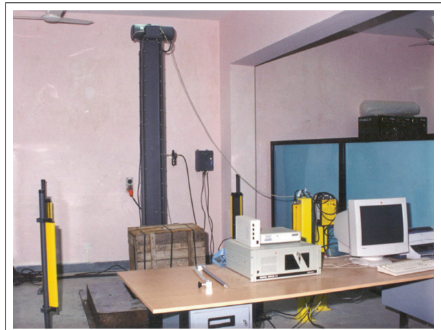
DROP TESTING MACHINE

Drop Test Method of Components for Handheld Electronic Products," is one of the widely used standards.