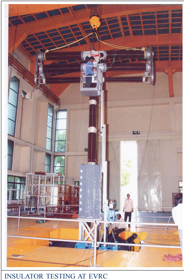
INSULATOR TESTING AT EVRC

Material handling facilities: The laboratory is equipped with 15 Ton EOT crane, fork lifts (5T and 1T capacity) and adjustable height hydraulic mobile platform for mounting transducers and inspection of test specimen.