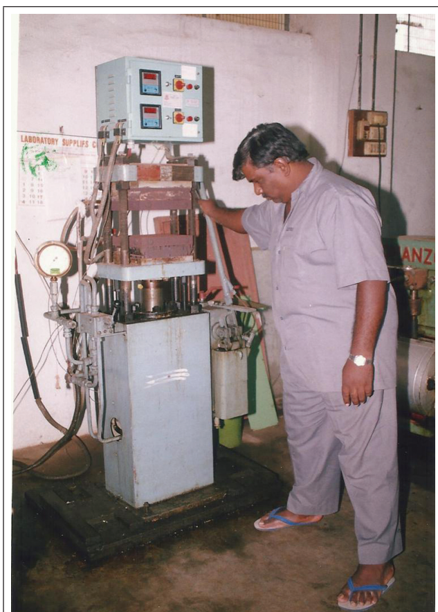
COMPRESSION MOULDING MACHINE