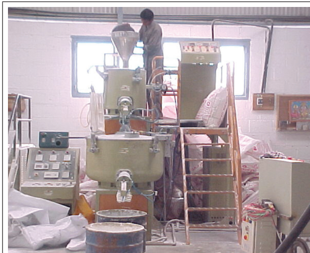
PVC COMPOUNDING UNIT