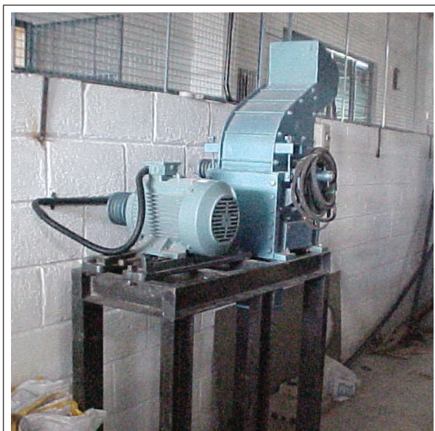
GLASS GRINDING UNIT

There have been a large number of failure cases of potential transformers that are being used at various stations of M/s. DMRC. The Train Depot, Shastri Park, Delhi of M/s. DMRC has sought the assistance of CPRI to study the failed PT of AB 249 of Chawri Bazar Metro station and to establish the process parameters and evaluation of the material for potential transformers.