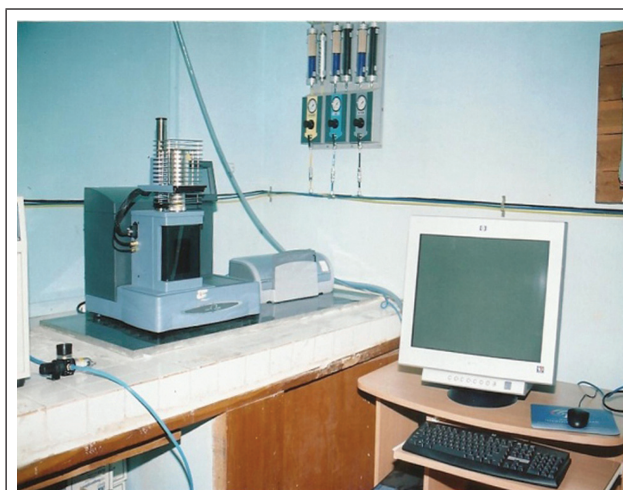
THERMO MECHANICAL ANALYSER

During 1990–2005, several sophisticated instruments like Fourier Transform Infra Red Spectro Photometer, Thermo Mechanical Analyzer, Mooney Viscometer, Rubber Curing Rheometer were procured and installed in the laboratory for spectral and cure studies. These facilities were more useful for Rubber based investigations taken up in the laboratory including the programme on development of Polymeric insulators for outdoor applications.