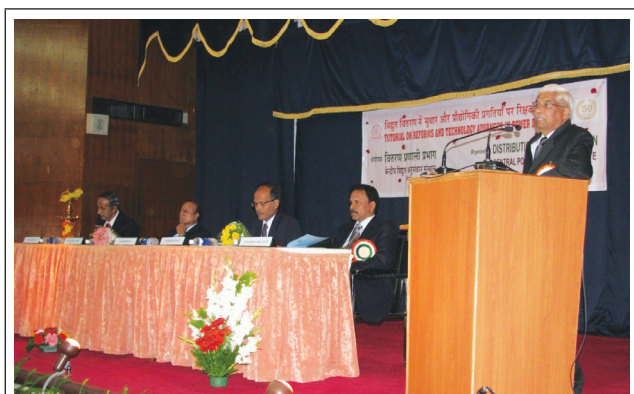
SHRI S.M. DHIMAN, MEMBER (GRID OPERATION AND DISTRIBUTION), CEA INAUGURATED A TWO DAY TUTORIAL ON “REFORMS AND TECHNOLOGY ADVANCES IN POWER DISTRIBUTION” DURING 6–7TH, JANUARY 2011