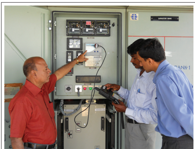
A FIELD STUDY CONDUCTED BY DISTRIBUTION SYSTEMS DIVISION

With the state-of-art facilities and software tools, the Division has been rendering consultancy services in finding solutions to various problems faced by the Electricity utilities and industries in the area of power distribution. The consultancy services are extended to the Electricity Regulatory Commission in estimation of losses in Distribution networks in various states. Recently, CPRI has bagged the prestigious consultancy as “Third Party Independent Evaluation Agency – Energy Audit (TPIEA-EA)” of Karnataka state under the R-APDRP of Ministry of Power, Govt. of India. The activities of RGGVY and R-APDRP works