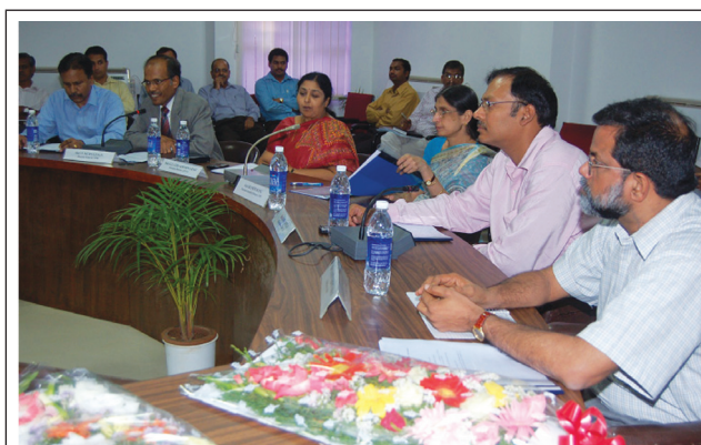
REVIEW OF PROGRESS OF R-APDRP IMPLEMENTATION IN KARNATAKA, ORGANIZED BY POWER FINANCE CORPORATION, NEW DELHI AT CPRI, BANGALORE ON 9TH JULY 2010 AND CONDUCTED BY THE PRINCIPAL SECRETARY (ENERGY), GoK. DIRECTOR GENERAL, CPRI WAS A SPECIAL INVITEE