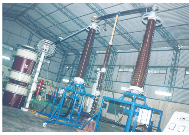
EXPERIMENTAL ARRANGEMENT FOR CABLE TESTING