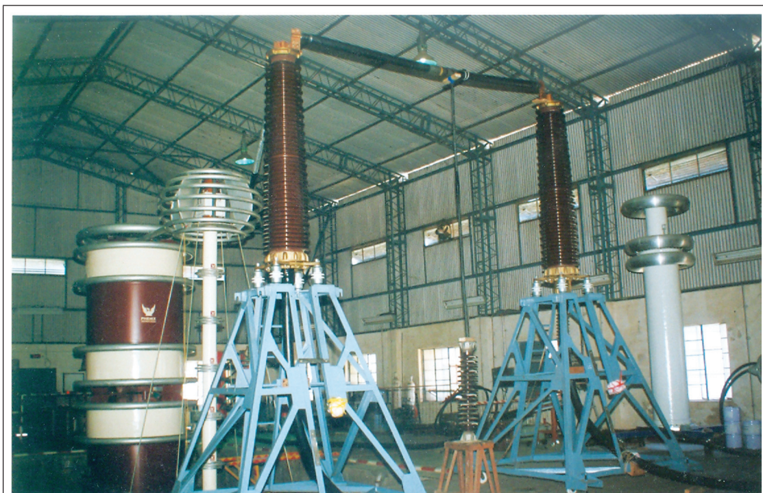
A VIEW OF TESTING BAY WITH 600 kV, 600 kVA AC SOURCE