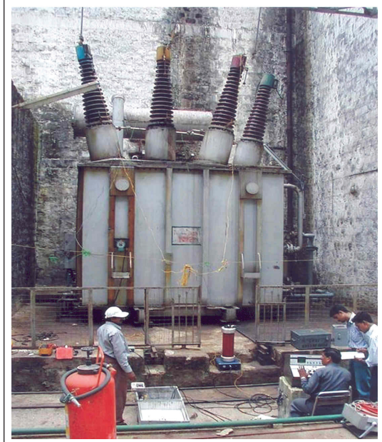
RLA STUDY ON TRANSFORMER AT SITE (DCCD)