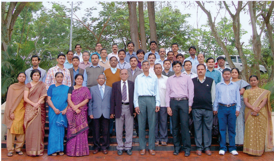
TEAM OF DCCD DURING TRAINING PROGRAM IN 2010