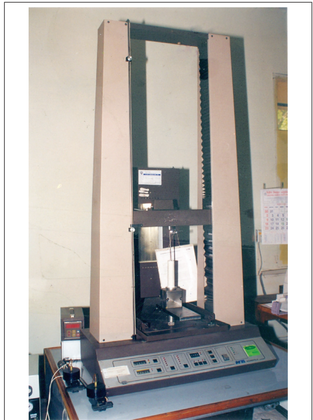
UTM FOR EVALUATION OF INSULATING MATERIALS

different classes of insulating materials such as (i) Class B, (ii) Class H and (iii) Class F.