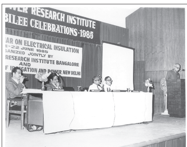
INAUGURATION FUNCTION OF SEMINAR ON ELECTRICAL INSULATION IN 1985