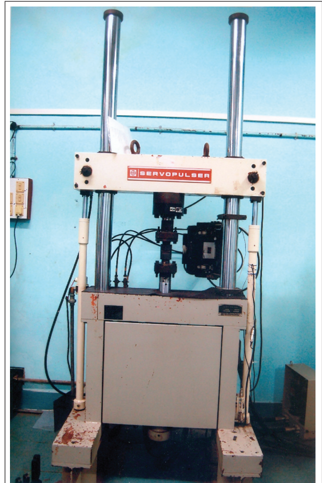
MOULDING MACHINE FOR DEVELOPING INSULATING MATERIAL