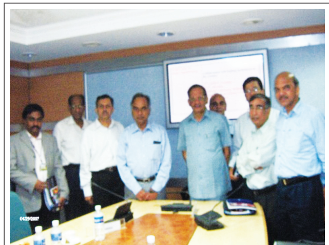
MoU WITH BESU