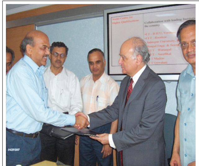
MoU WITH IIT-ROORKEE

CPRI/CCAR has entered into MoU with IIT, Roorkee, IIT-Madras, Banaras Hindu University, Jadavpur University, Bengal Engineering and Science University, National Institute of Technology – Warangal, National Institute of Technology – Surathkal and University of Saskatchewan, Canada. The MoU covers academic activity leading to higher qualifications to sponsored candidates from PSUs under MoP, Collaborative research and continuing education through short-term courses relevant to Indian power sector.