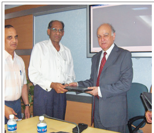
MoU WITH NIT-WARANGAL