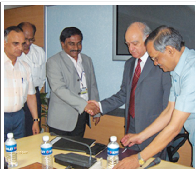
MoU WITH NIT-SURATHKAL