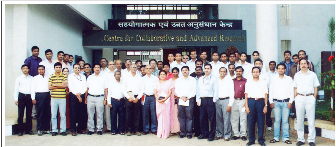
ONE YEAR COURSE – 1ST BATCH