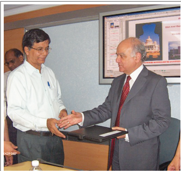
MoU WITH JADHAVPUR UNIVERSITY