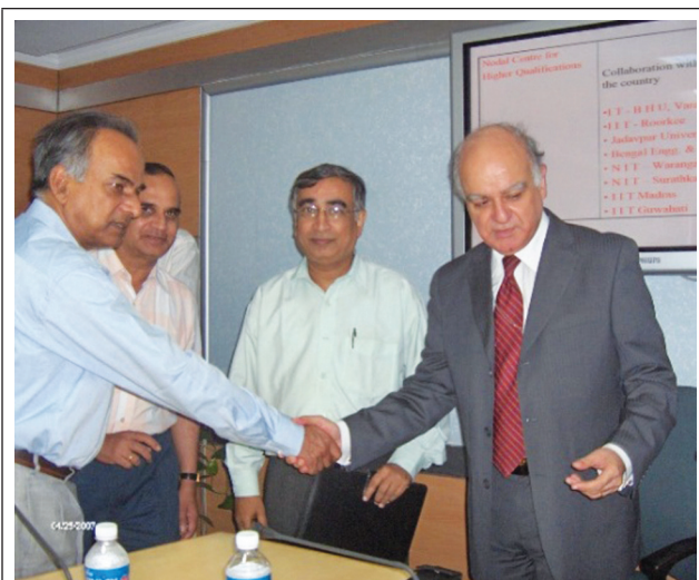
MoU WITH BHU